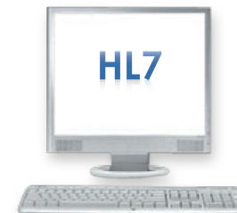
HL7/ADT PATIENT INFORMATION