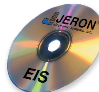
EXECUTIVE INFORMATION SYSTEMS