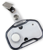
REAL TIME LOCATING